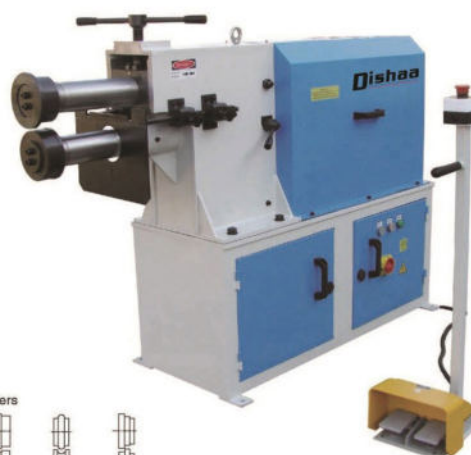
DEBB 25 DEBB 40