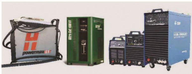
Plasma Power Sources