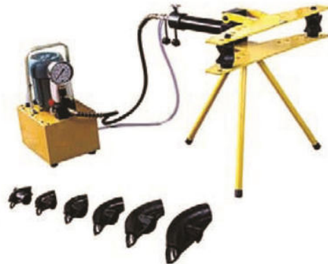
optional tripod stand