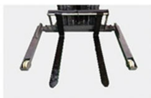
Customized Led (Optional)