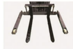
Customized Leg (Optional)