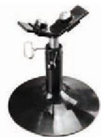
Model 658C Pipe Support Stand