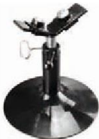
Model 658C Pipe Support Stand