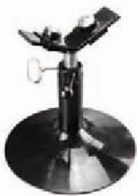
Model 658C Pipe Support Stand