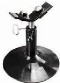
Model 658C Pipe Support Stand