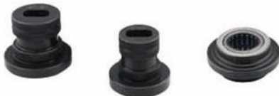
Roller set and Shaft