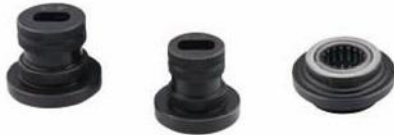
Roller set and Shaft