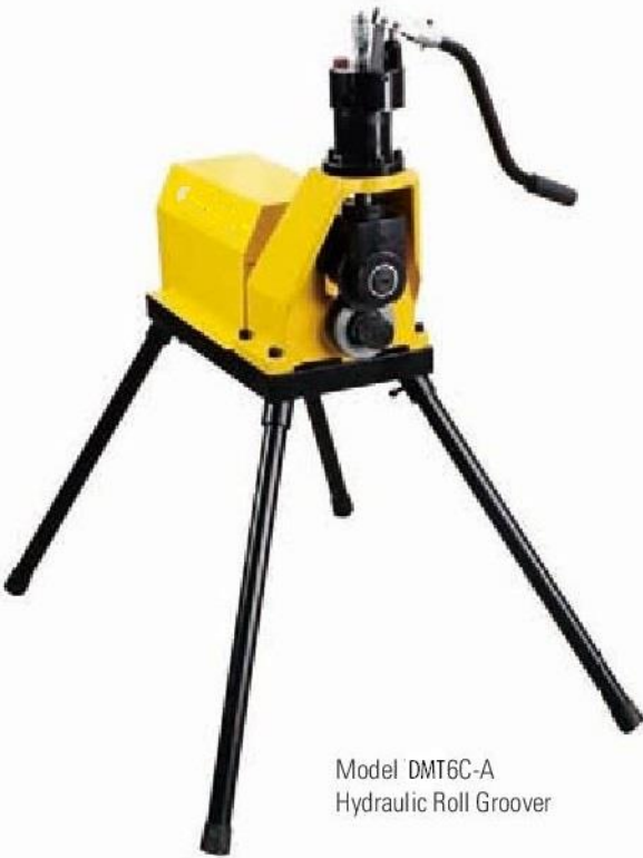
Model DMT6C-A Hydraulic Roll Groover