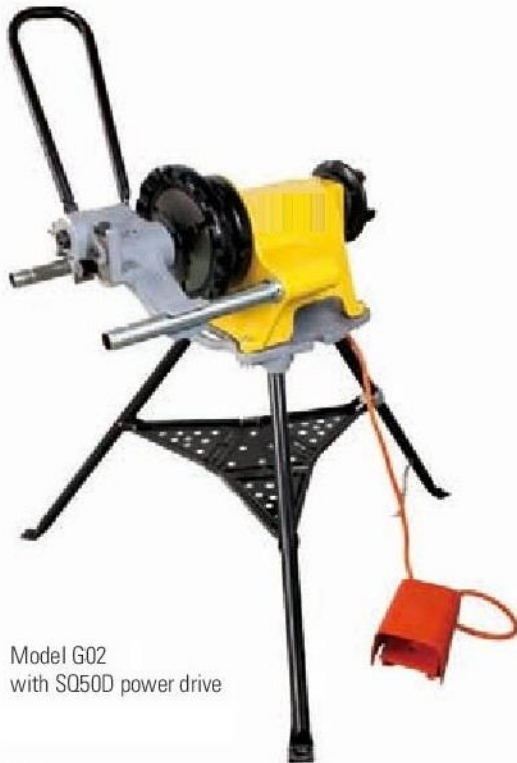
Model G02 with SQ500 power drive