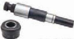
Roller Set 1/4" -6"