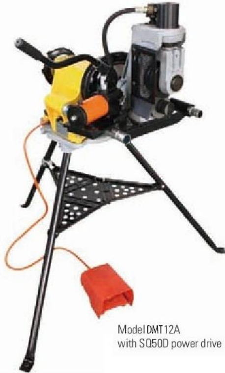
Model DMT12A with SQ50D power drive