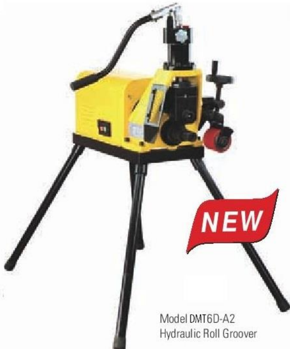
Model DMT6D-A2 Hydraulic Roll Groover