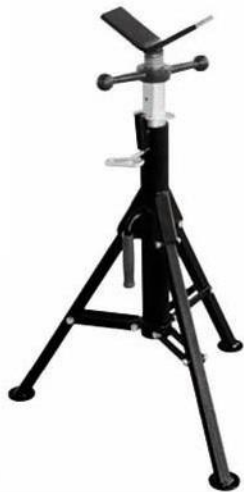
Model 1107 Pipe Support Stand for Roll Groovers For option