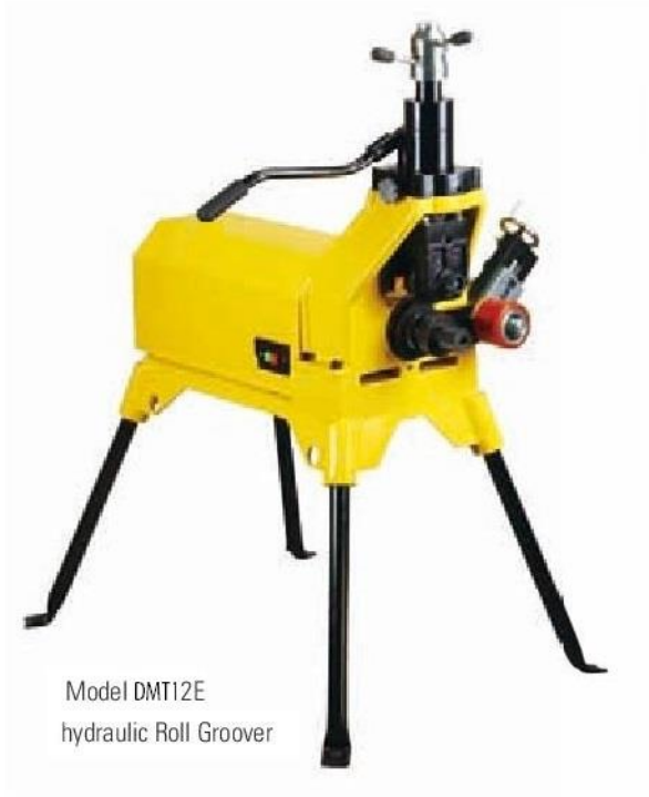
Model DMT12E hydraulic Roll Groover