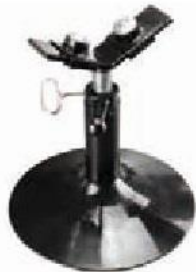
Model 658C Pipe Support Stand