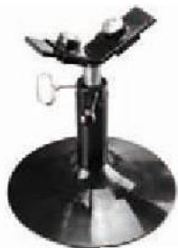
Model 658C Pipe Support Stand