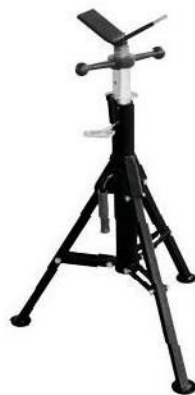
Model 1107 Pipe Support Stand for Roll Groovers For option