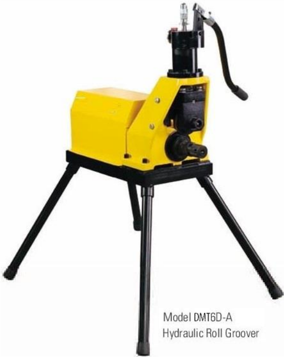
Model DMT6D-A Hydraulic Roll Groover