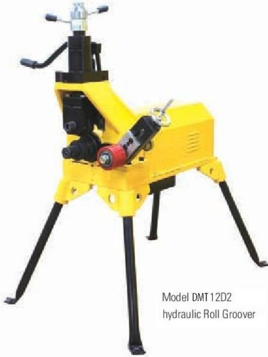
Model DMT 12D2 hydraulic Roll Groover